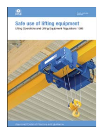
L113 (Second edition) Published 2014

This Approved Code of Practice and guidance is for those that work with any lifting equipment provided at work or for the use of people at work, those who employ such people, those that represent them and those who act as a competent person in the examination of lifting equipment.